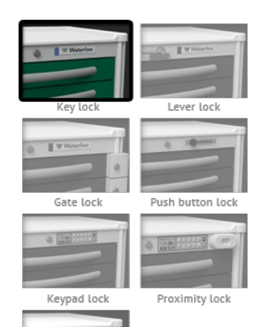
Dual Access lock